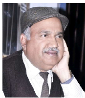
By: Vijay GarG

Relatively lower cost of education and easy access to Western Europe makes Ukraine a popular destination for medical students. Every year, 20-25,000 students from India, aspiring to become doctors, but with budgets tighter than what is required to secure an MBBS seats in a private medical college at home, head out of the country. Nearly a quarter of them go to Ukraine for the cost advantage it offers as well as its location which provides easy access to Western Europe, say consultants who track these trends. A four-and-a-half-year medical course in Ukraine, and even in Russia, costs Rs 24-30 lakh. In comparison, pursuing MBBS in countries such as Mauritius and Netherlands can set students back by Rs 50-55 lakh. In India, privately run medical colleges charge a steeper Rs 70 lakh-Rs 1.2 crore for MBBS.